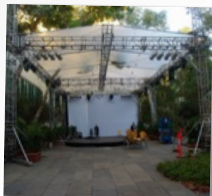
NATIONAL GALLERY, CANBERRA