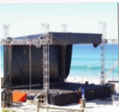
GROUND SUPPORT & STAGE AT CRONULLA

Please call us on 02 9666 4642, or email office@tripointrigging.com to discuss your project.